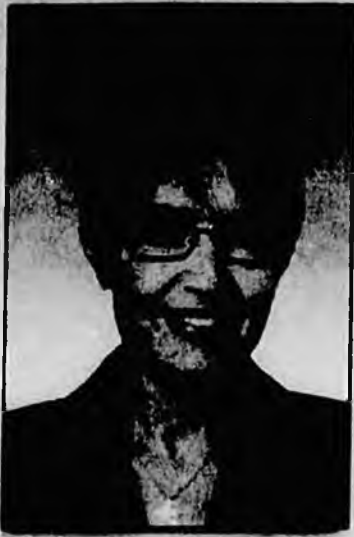
Palin continues to appoint cabinet members she considers incorruptible.