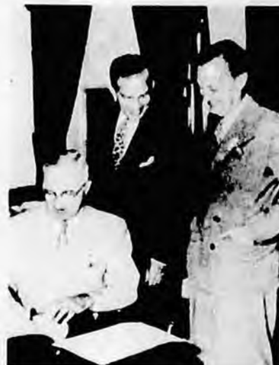
President Harry S. Truman signs the Fulbright Act into law. 1946.