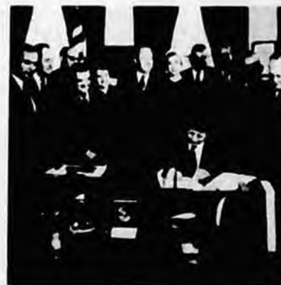
President John F. Kennedy signs the Fulbright-Hays Act into law, 1961.