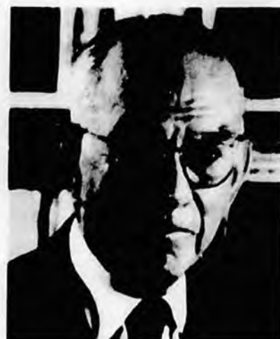
J. William Fulbright