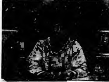
Gov. Sarah Palin