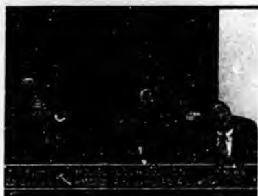
Rep. Harry Crawford, D-Anchorage