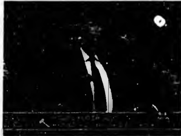
Rep. Mike Hawker, R-Anchorage

JUNEAU, Alaska –The Alaska House of Representatives agreed Tuesday to grant TransCanada a license for a natural gas pipeline