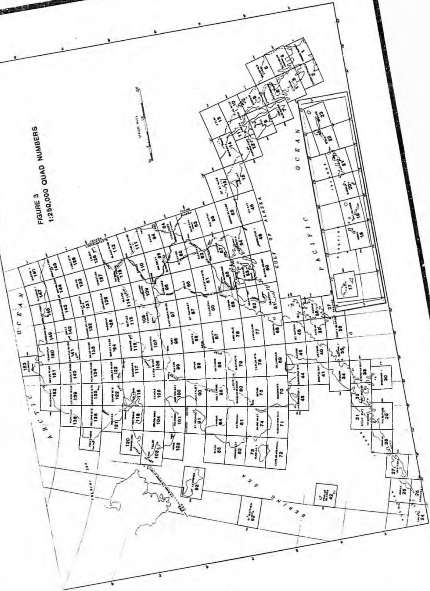
FIGURE 3 1:250,000 QUAD NUMBERS