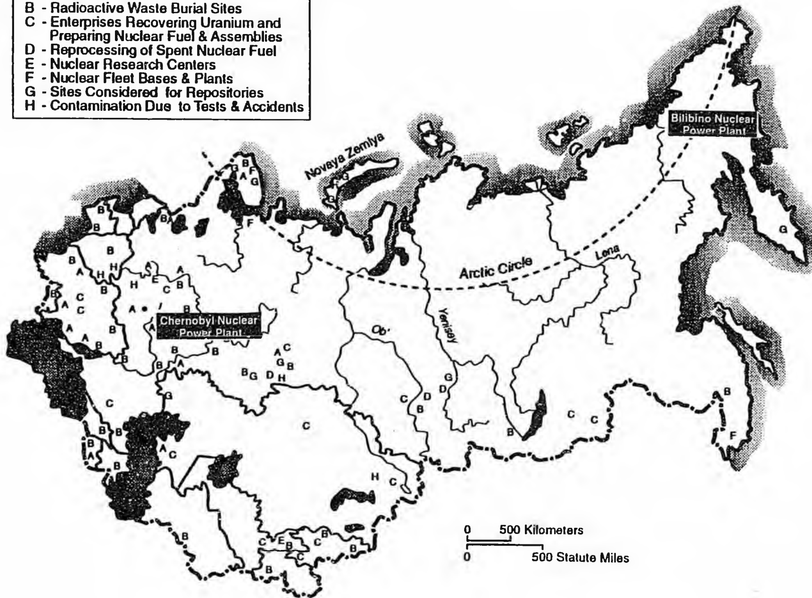
Figure 2. Radioactive Contamination Map of the Former Soviet Union

(from Radioactive Contamination of the Arctic Region, Baltic Sea, and the Sea of Japan from Activity in the Former Soviet Union, USDOE, September 1992).