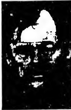
Gov. Steve Cowper