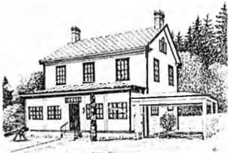
HC and Post Office Ft. Wm. H. Seward