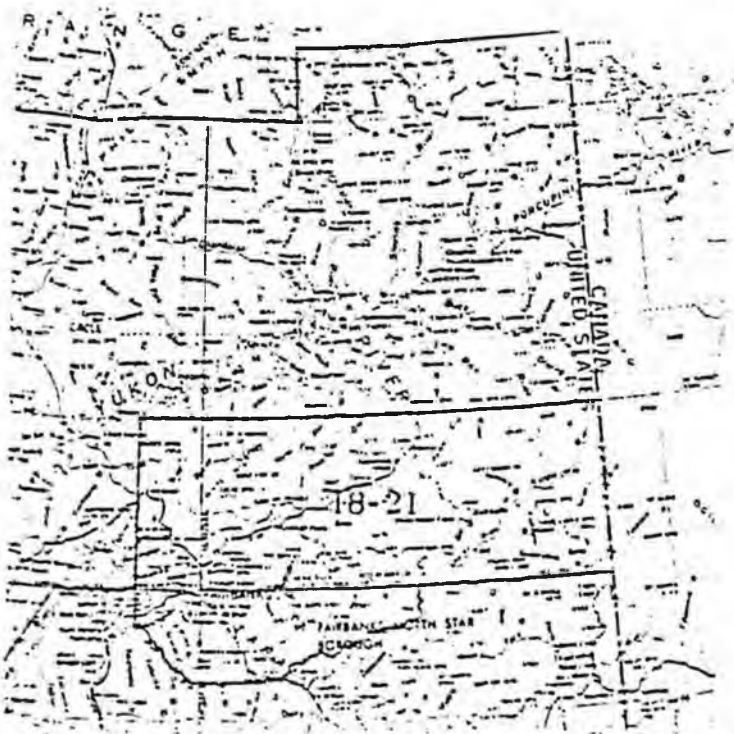
Election District 18-21 Fairbanks Soil & Water Conservation District 247 Cooperators