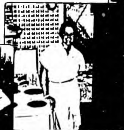
Two participants in the Independent Living Subsidy Program enjoy their new apartments.