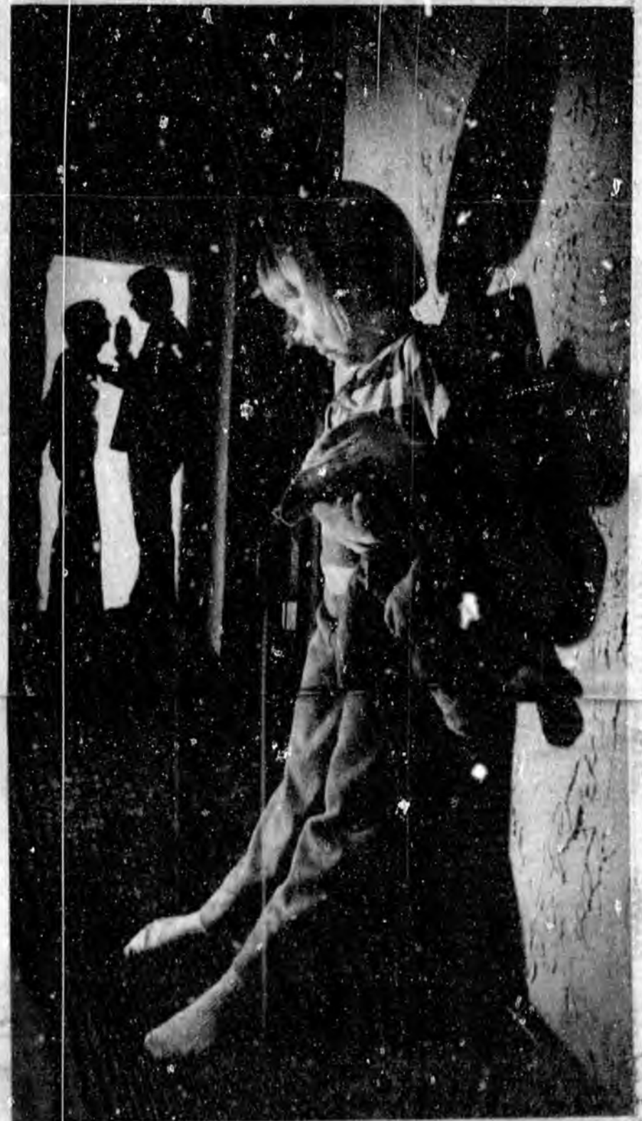
TURMOIL AT HOME —Domestic violence has its effect on the children, who often feel unwanted and responsible for their parents' fighting. A recent study indicates that one-sixth of all American couples each year experience "a violent episode," ranging from an occasional slap to homicide. In Fairbanks, domestic violence is a serious problem and it's getting worse, experts say.

For Thursday: an interview with a victim of domestic violence.