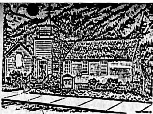
Douglas Community United Methodist Church Douglas, Alaska