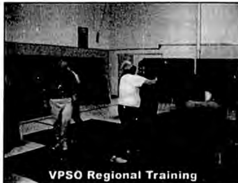
VPSO Regional Training