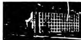
Figure 1. The new Central Laboratory of the Virginia Division of Forensic Science is located in downtown Richmond, Virginia.

Dr. Ferrara: The Commonwealth of Virginia was the first state to pass a