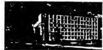
Figure 1. The new Central Laboratory of the Virginia Division of Forensic Science is located in downtown Richmond, Virginia.

Dr. Ferrara: The Commonwealth of Virginia was the first state to pass a