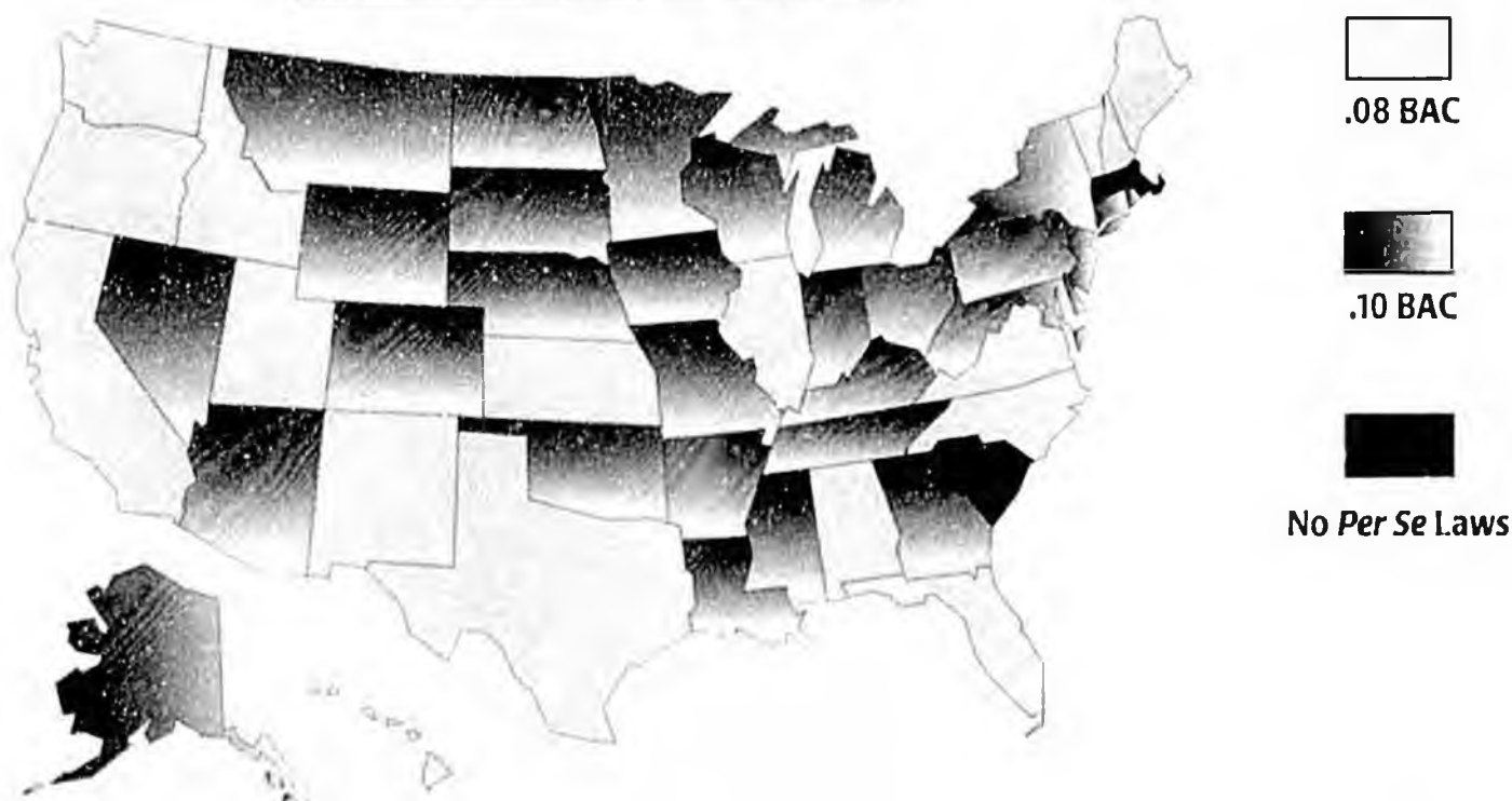
States With BAC per se Laws