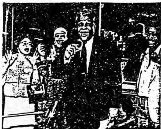
Mayor Washington at a rally with senior citizens