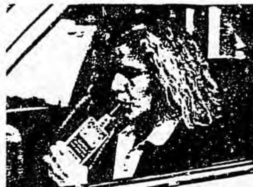
If she had one for the road, her car won't start