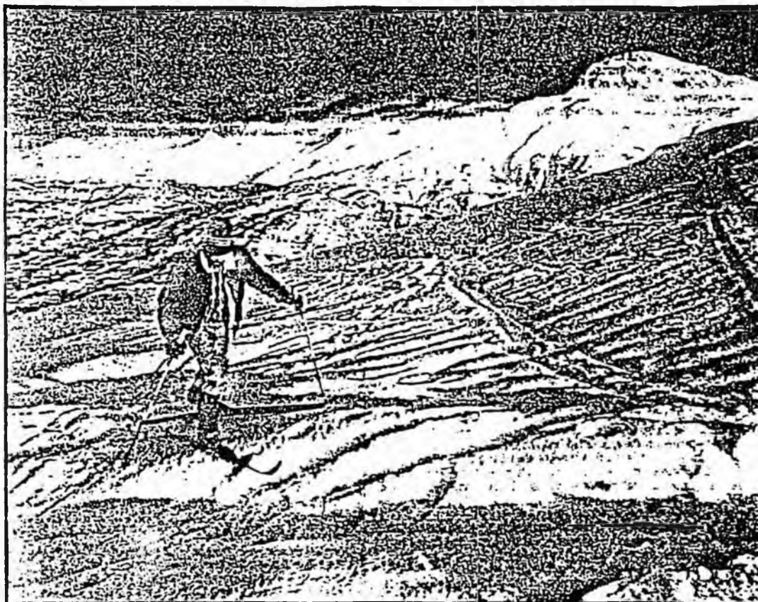
The bright side of winter

An insurance company keeps 40 cents of every dollar paid in; a pool needs only five cents of every dollar for administrative costs, Farnsworth said, which means an immediate savings for (Please turn to Page 6)