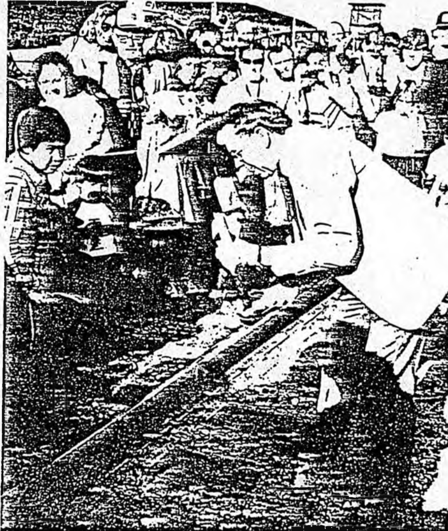
At a re-enactment of the original golden spike ceremony Governor Sheffield wields the same maul used by President Harding in 1923.