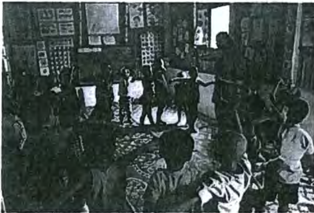
A woman teacher leads children in a game involving singing and role playing at a BRAC childcare centre in the Mirpur sub-district of Dhaka, the capital.

By resolution 836(IX) of 14 December 1954, the General Assembly recommended that all countries institute a Universal Children's Day, to be observed a day of worldwide fraternity and understanding between children. It recommended that the Day was to be observed also as a day of activity devoted to promoting the ideals and objectives of the Charter and the welfare of the children of the world. The Assembly suggested to governments that the Day be observed on the date and in the way which each considers appropriate. The date 20 November, marks the day on which the Assembly adopted the Declaration of the Rights of the Child , in 1959, and the Convention on the Rights of the Child , in 1989.