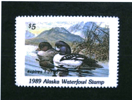
1989 Alaska State Duck Migratory Waterfowl Stamp MNHOG