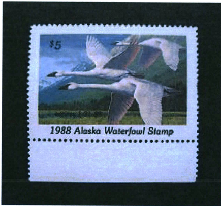
1988 Alaska State Duck Migratory Waterfowl Stamp MNHOG