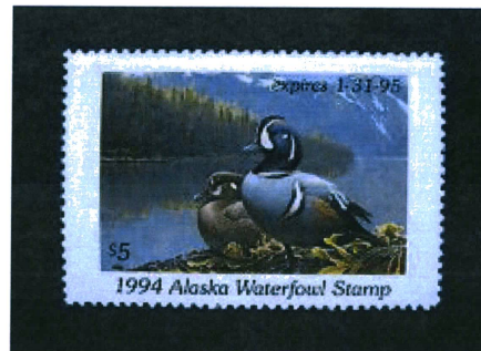
1994 Alaska State Duck Migratory Waterfowl Stamp MNHOG