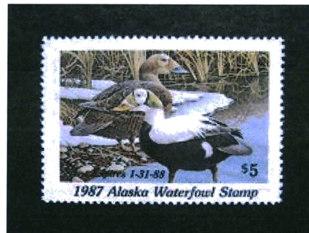
1987 Alaska State Duck Migratory Waterfowl Stamp MNHOG