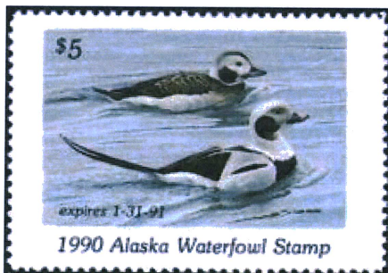
1990 Alaska State Duck Stamp Mint Never Hinged VF