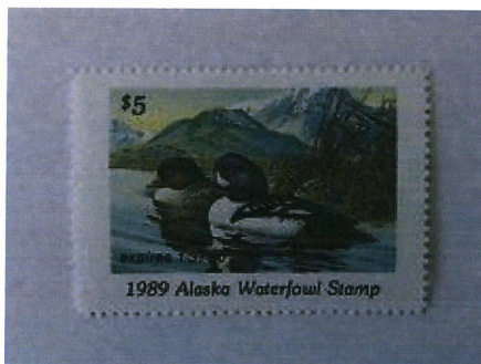
1989 Alaska Duck Hunting License Stamp