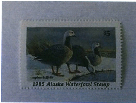
1985 Alaska Duck Hunting License Stamp