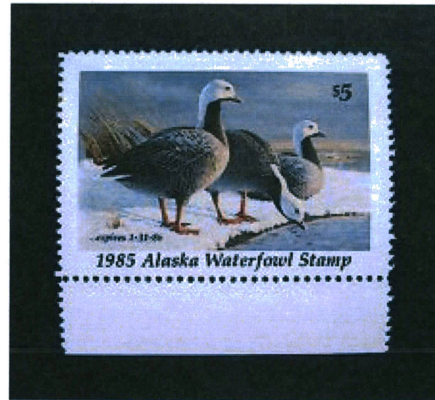
1985 Alaska State Duck Migratory Waterfowl Stamp MNHOG