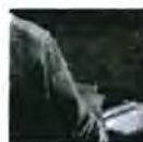
Minnesota State Colleges and Universities waive application fees this week Oct. 26, 2015, 7:43 a.m.