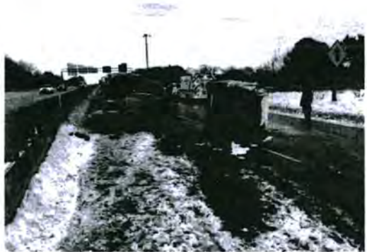
The crash scene.