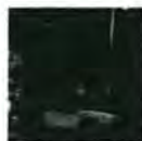
Crews put out fire at North Minneapolis duplex Oct. 26, 2015, 6:22 a.m.