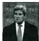
John Kerry: Islamic State committing genocide 01:15