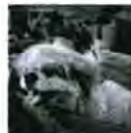
6 fun facts about St. Patrick's Day 00:41