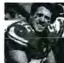
Vikings players serving up coffee at Twin Cities Caribou Coffee shops Oct. 27, 2015, 7:26 a.m.