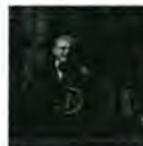
Garland: Supreme Court nomination 'greatest honor of my life' 01:48