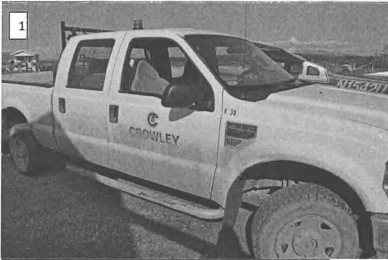
This is an example of the F350 that would be exempt.