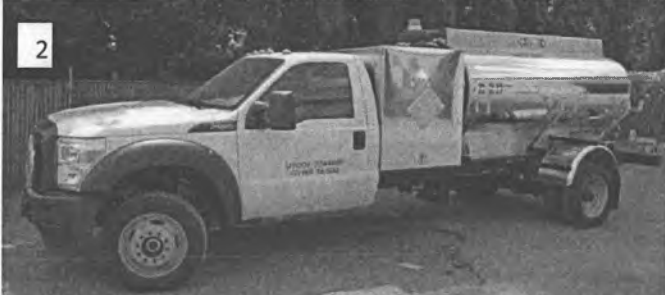
These are examples of CPD trucks that would still require a CDL to operate. Photos 1 & 2 are of trucks that are the same size (F3350), but photo two would still require the CDL because it is attached to a propane trailer.