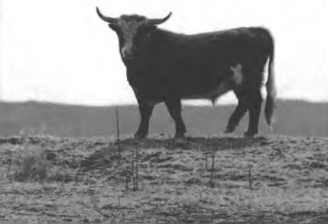
Bull on Wosnesenski Island: Photo Credit - USFWS / Steve Ebert

AS 41.37.160 The Citizens Advisory Commission on Federal Management Areas in Alaska is established in the department [Natural Resources]. In the exercise of its responsibilities, the commission shall consider the views of citizens of the state and officials of the state.