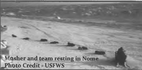
Musher and team resting in Nome

National Marine Fisheries Service http://www.nmfs.noaa.gov/