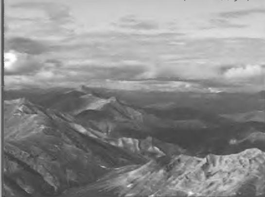
Mountainous Gates of the Arctic in Summer (USFWS 8/1/1980)

For more information please contact Greg Dudgeon, Superintendent, Gates of the Arctic National Park and Preserve, 4175 Geist Road, Fairbanks, AK 99709-3420; telephone (907) 457-5752. ♦