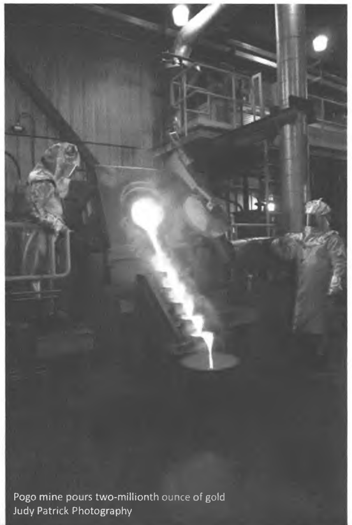
Pogo mine pours two-millionth ounce of gold