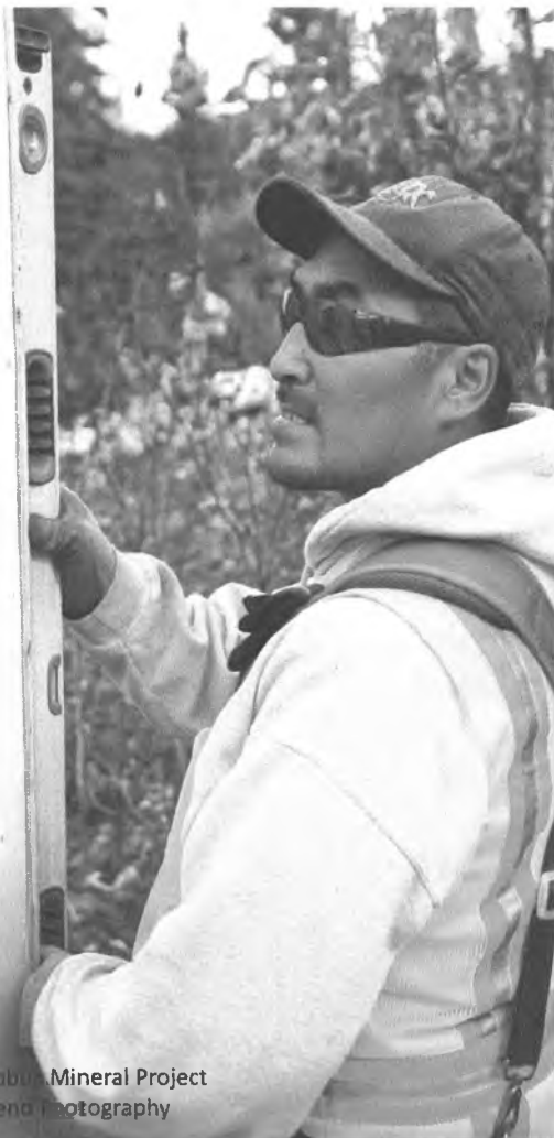
NANA Upper Kobuk Mineral Project