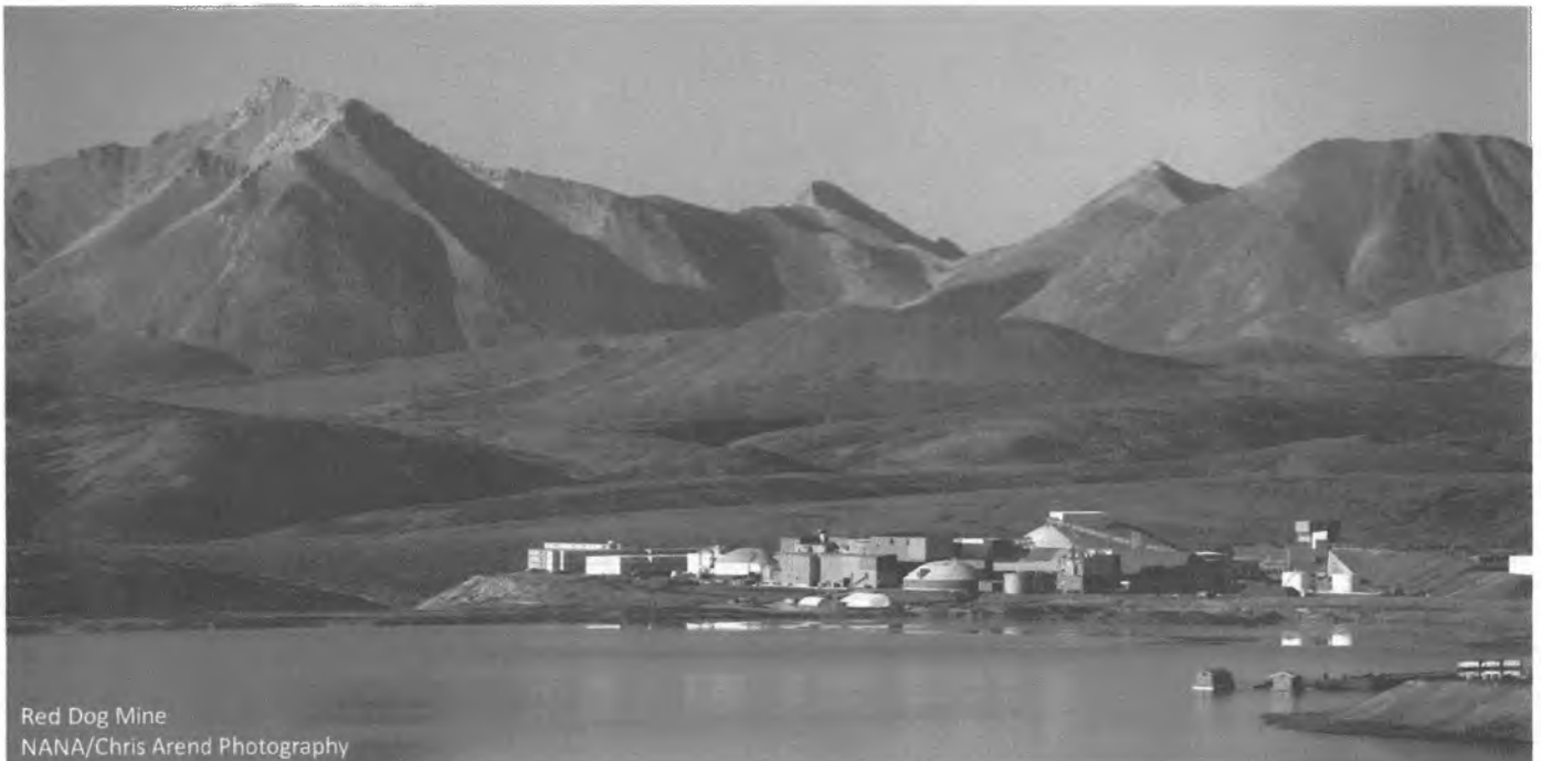
Red Dog Mine