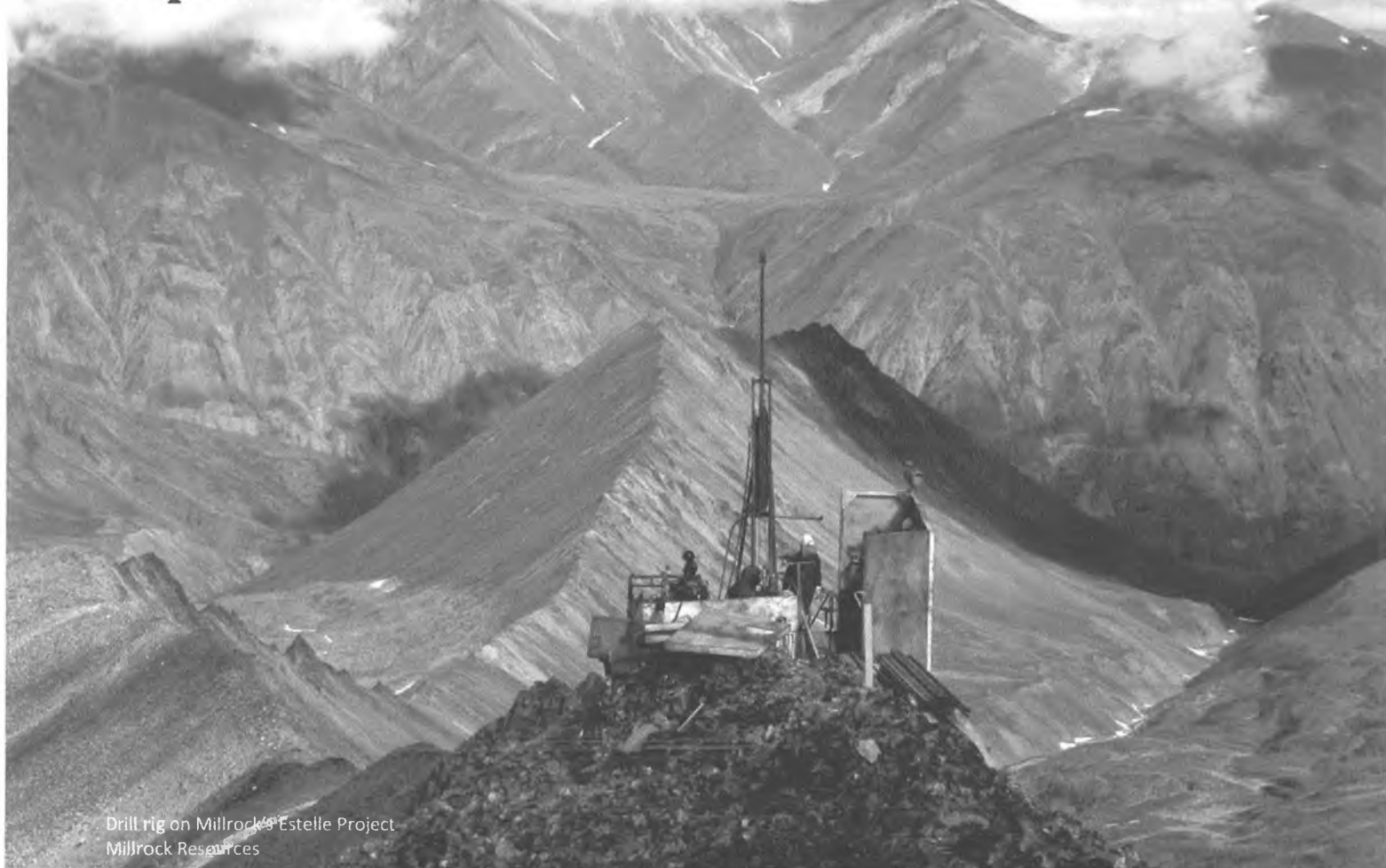
Drill rig on Millrock's Estelle Project Millrock Resources

The Alaska Minerals Commission (Commission) serves in an advisory capacity to the Governor and the Alaska State Legislature (Legislature). Its role is to recommend ways to mitigate constraints on mineral development in Alaska. This annual report fulfills that mandate.