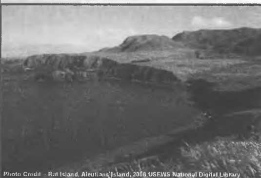
Photo Credit - Rat Island, Aleutian Island, 2008 USFWS National Digital Library

For the first time ever, breeding tufted puffins ( Fratercula cirrhata ) have been documented on the island in the Alaska Maritime National Wildlife Refuge. Species thought to have been extirpated because of the rats, such as Leach's storm-petrels ( Oceanodroma leucorhoa ) and fork-tailed storm-petrels ( Oceanodroma furcata ), have been recorded on-