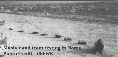
Musher and team resting in Nome