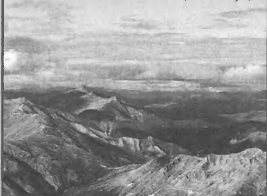
Mountainous Gates of the Arctic in Summer (USFWS 8/1/1980)

For more information please contact Greg Dudgeon, Superintendent, Gates of the Arctic National Park and Preserve, 4175 Geist Road, Fairbanks, AK 99709-3420; telephone (907) 457-5752. ♦