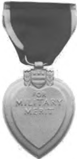
Purple Heart (reverse)

Army regulations specified the design of the medal as an enamel heart, purple in color and showing a relief profile of George Washington in Continental Army uniform within a quarter-inch bronze border. Above the enameled heart is Washington's family coat of arms between two sprays of leaves. On the reverse side, below the shield and leaves, is a raised bronze heart without enamel bearing the inscription "For Military Merit." The 1 11/16 inch medal is suspended by a purple cloth, 1 3/8 inches in length by 1 3/8 inches in width with 1/8-inch white edges.