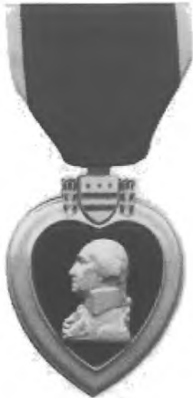
Purple Heart (obverse)