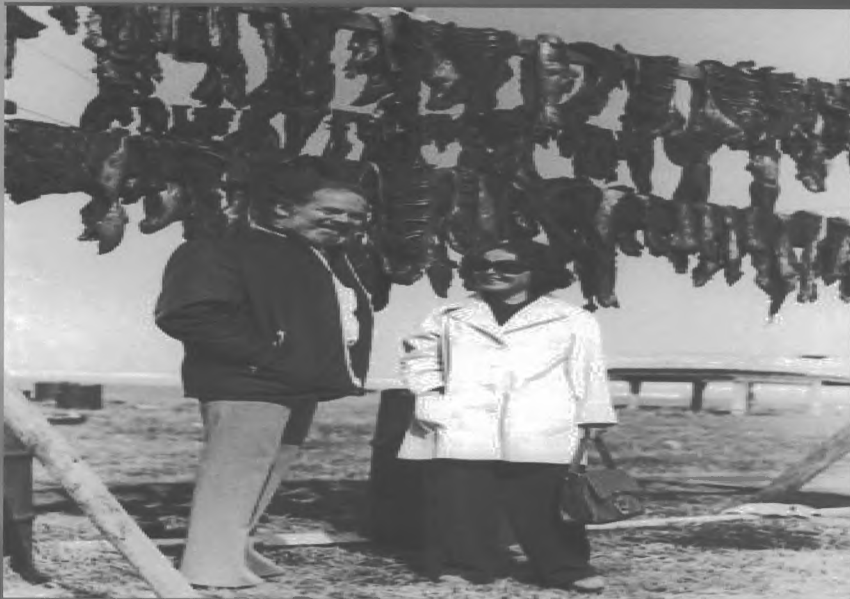
Alaska State Library - Historical Collections