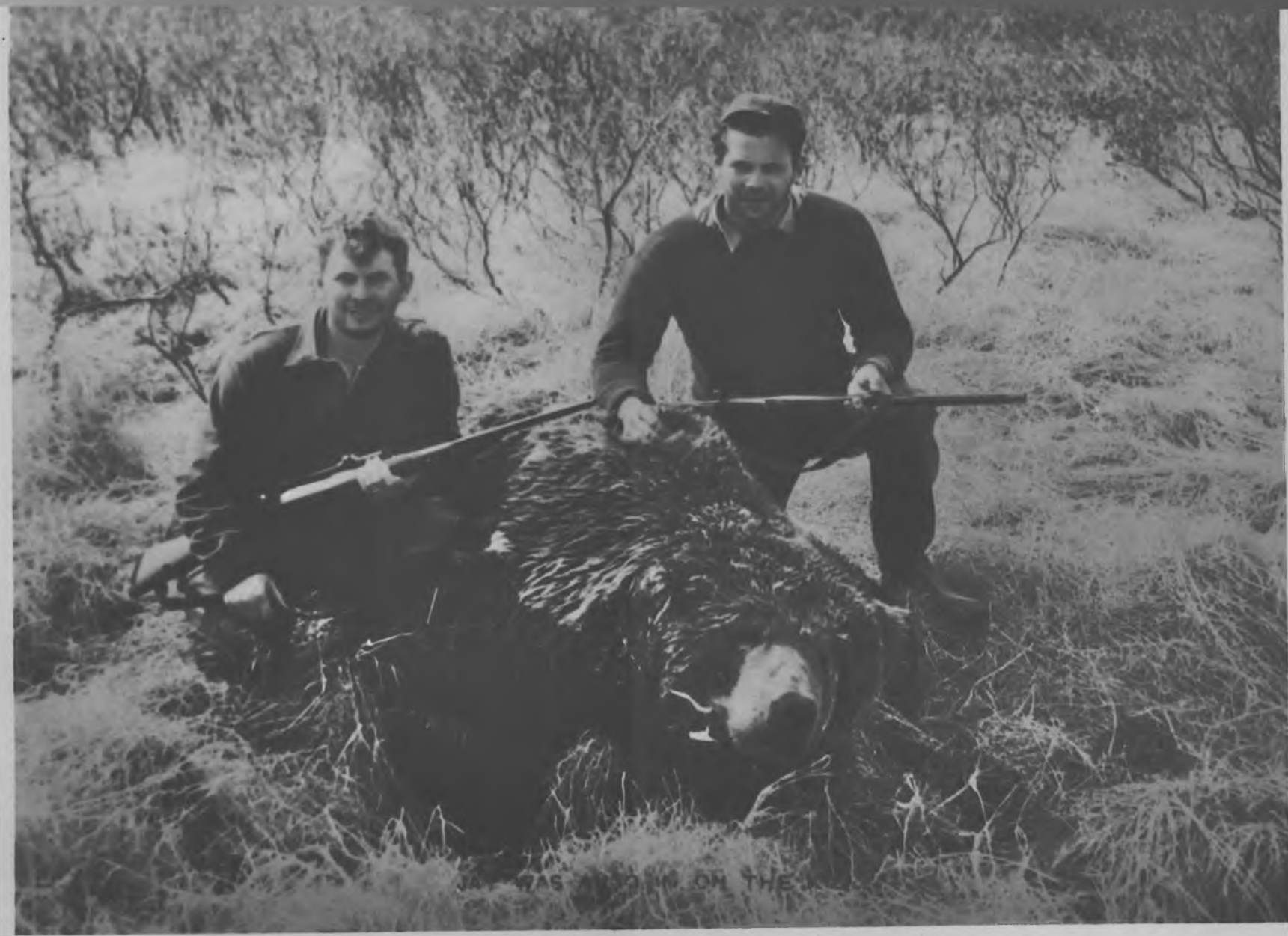
AS DOWN ON THE