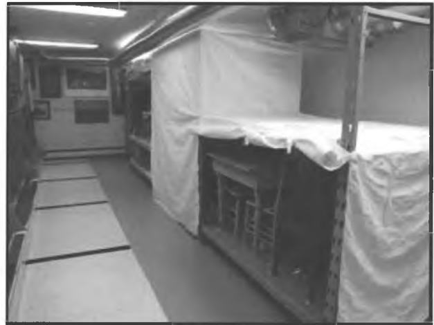
Dust covers purchased in anticipation of the HVAC installation process.

All possible moving and storage costs, as well as other costs of protecting the collection were written into the project budget, as well as into the RFP issued when hiring a firm to undertake the project.