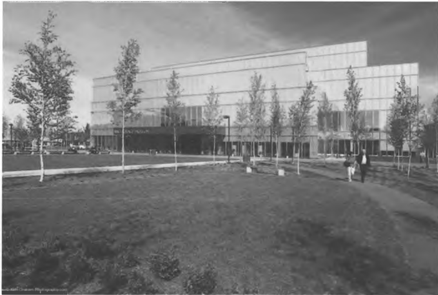
The exterior of the Anchorage Museum addition newly opened in May 2010.

The Anchorage Museum of History and Art, which opened in 1968, began as a public-private partnership between the Cook Inlet Historical Society and the Municipality of Anchorage. The partnership formed to celebrate the centennial of the United States' purchase of Alaska from Russia. The museum is located in downtown Anchorage at 625 C Street.