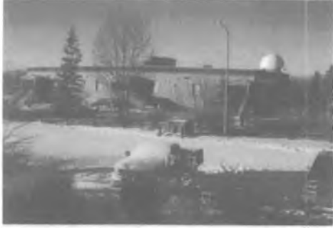
Two Seasons Dining Hall