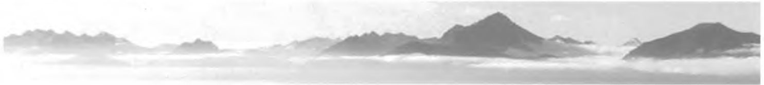
View from Baycrest Hill in Homer, Alaska