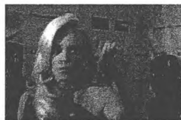
Jenny McCarthy at Leather and Laces Party for Super Bowl 2012 Feb. 03, 2012