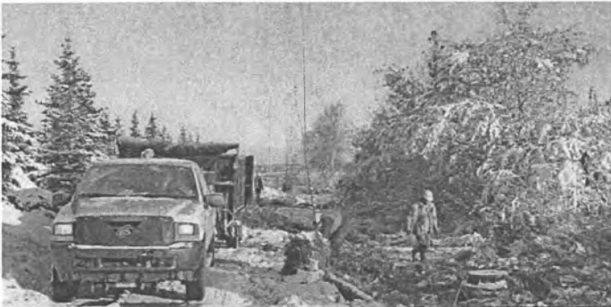
Moose browse removed from New Seward Hwy

A project was put together to help increase safety in the very corridor where this particular trag-