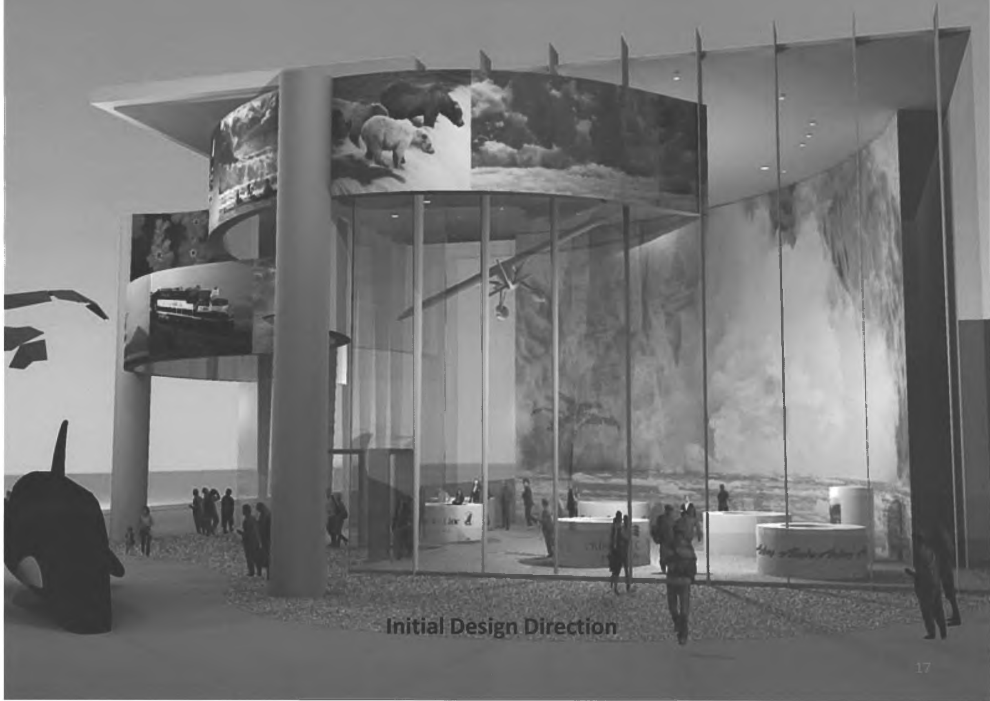
Initial Design Direction