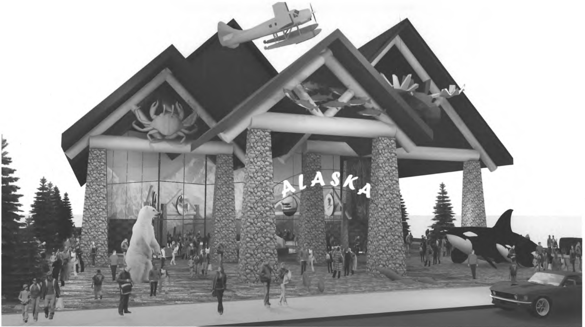
Showcasing the Magic of Alaska