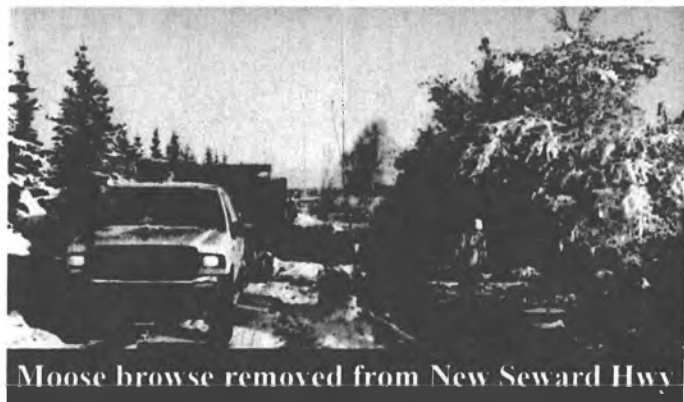
Moose browse removed from New Seward Hwy

A project was put together to help increase safety in the very corridor where this particular trag-