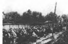
Jews on foot being marched westward to the border and deportation.

In the days that followed, Wallenberg made repeated trips along the march route and continued his rescue efforts at the border. He organized Red Cross truck convoys to deliver food and set up checkpoints for those with "Schutzpasses". About 1,500 people were thus rescued from transport to Auschwitz.