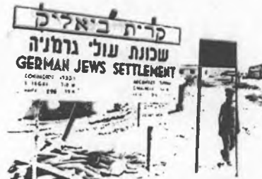
Settlements for Jews fleeing Nazi persecution in Haifa

Wallenberg was increasingly concerned with the fate of Europe's Jewish communities. Actress Viveca Lindfors , a friend of Raoul's during his bachelor days in Stockholm, recalls an evening when he took her back to his office. There, he began to tell her of the plight of the Jews in Nazi Europe. His stories, told with frightening intensity, sounded impossible to her.