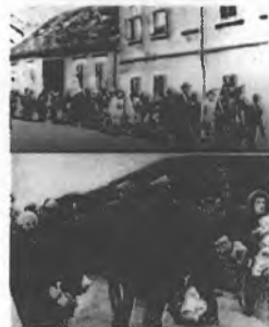
Between March and June 1944 427,000 Hungarian Jews were deported. In 46 working days nearly a quarter of a million of them were exterminated.

In the United States, at the behest of President Roosevelt, the War Refugee Board was established. Its goal was to save Jews and other Nazi victims. The WRB was well funded. Its top priority, after the partial Nazi Hungarian occupation in June 1944, became the safety of the 750,000 Hungarian Jews.