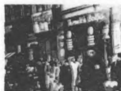
Jewish women being marched through Budapest to a holding camp, prior to deportation. This photograph was taken by Wallenberg.

John Bierman , in his book on Wallenberg, RIGHTEOUS GENTILE , has included a moving eye-witness account of Wallenberg's work. They are the words of Tommy Lapid , now director-general of the Israeli Broadcasting Authority. In 1944 Lapid was 13 years old and one of 900 people crowded into a Swedish protected house. His father was dead, and he had been allowed to remain with his mother.