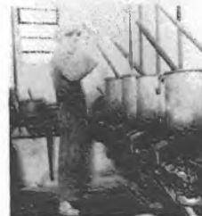
A soup kitchen established by Wallenberg.

Wallenberg persuaded the Hungarian authorities to free the Jews on his staff from wearing the Yellow Star worn at all times by other Jews. This simple exemption allowed his workers much greater freedom of movement, as well as the protection of anonymity - an essential factor in carrying out many of Wallenberg's missions.