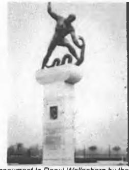
A monument to Raoul Wallenberg by the Hungarian Sculptor

Therefore we must do more than cling to his memory. We must proclaim to all the nations that Raoul Wallenberg lives, tirelessly champion his cause, tirelessly press for news of his fate - till the day, if it please God, that Raoul Wallenberg returns to us from the long, bitter totalitarian night.