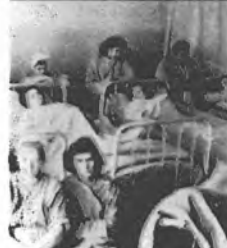
A hospital established by Wallenberg.

Wallenberg's next step was crucial to ultimate success. In a section of Budapest designated by the Hungarian government as the "International Ghetto", Wallenberg purchased thirty buildings where he flew Swedish flags next to the Jewish Star. These buildings, and others for which he was able to negotiate, were given the full protection of the Swedish government. In these protected houses, Wallenberg set up hospitals, schools, soup kitchens, and a special shelter for 8,000 children whose parents had already been deported or killed.