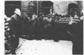
Hungarian gendarmes execute an 'uncooperative' Jewish leader.