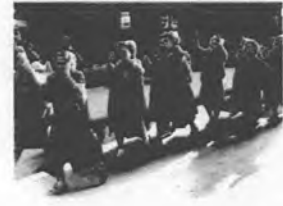
Women being forced at gunpoint to join a death march.