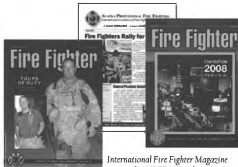
International Fire Fighter Magazine and AKPFFA Newsletter

Mailing Address Post Office Box 111222 Anchorage, Alaska 99511