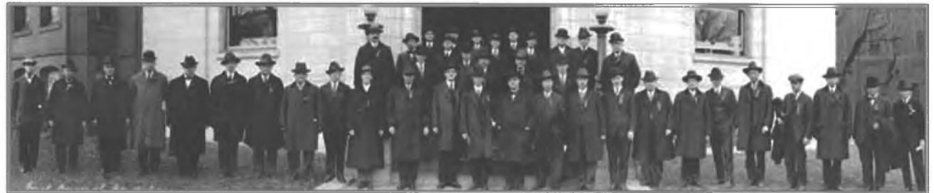
Delegates to the 1918 Founding Convention

From the Preamble of the Constitution and By-Laws of the International Association of Fire Fighters