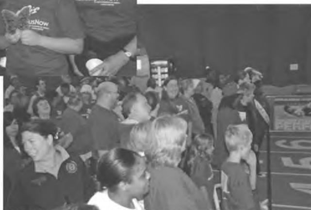
Individuals and teams on the start line

2 nd Wine Tasting and Silent Auction – This successful fundraising event was held in partnership with Wine Styles on April 24 th at O'Malleys on the Green and raised $7,000.