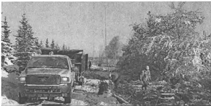
Moose browse removed from New Seward Hwy

A project was put together to help increase safety in the very corridor where this particular trag-