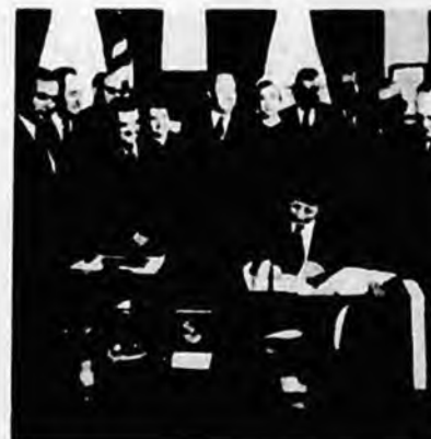
President John F. Kennedy signs the Fulbright-Hays Act into law, 1961.