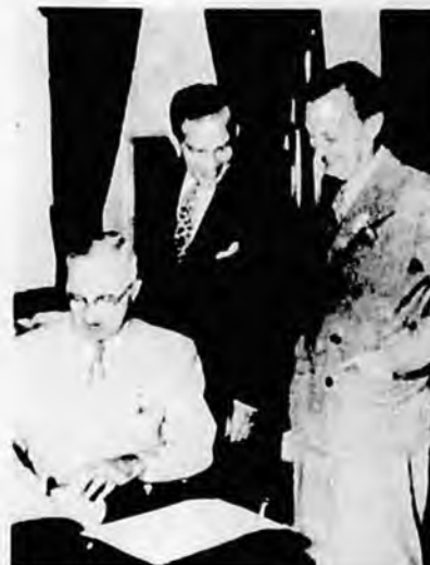
President Harry S. Truman signs the Fulbright Act into law. 1946.