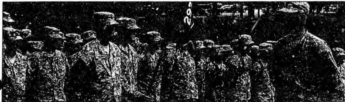
Largest Single Deployment Since World War II. Nearly 600 Alaska Army National Guard Soldiers look three months to prepare for their Operation Iraqi Freedom deployment to Kuwait, at Camp Shelby, Mississippi. The troops will serve for 12 months boots on the ground in Kuwait.

– Progress with Aviators. 1st Battalion, 207th Aviation transformed to an Air Assault Battalion in 2006. Result: UH-60 Black Hawk helicopters will increase from 24 to 30 aircraft. One company, with 10 aircraft, is assigned in Hawaii.