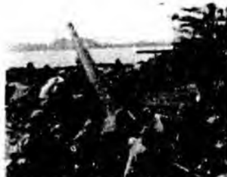
Ft. Rousseau WWII era cannon