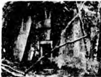
Ft. Rousseau WWII Ammo Magazine

Register of Historic Places and designated a historical landmark by the National Parks Service. Preservation of the unique historical features of the Fort Rousseau area will remind all visitors about Alaska's role in WWII and allow for a glimpse into the life of the soldiers who stood ready to defend their country.