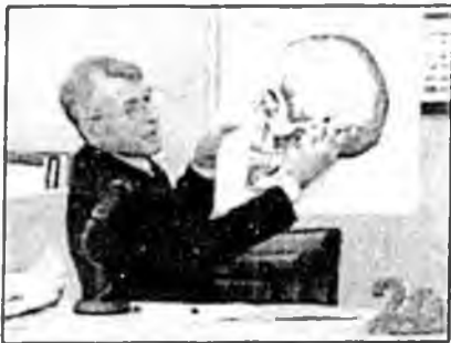
Channel 2 News

"There would be multiple bodies in this institution and we could not get the bodies out the door fast enough to the proper relatives and so forth," he says. "That could be a problem."