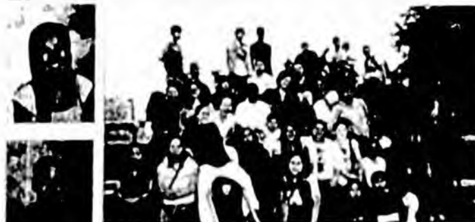
Beginning the School Year with "Jump Start"