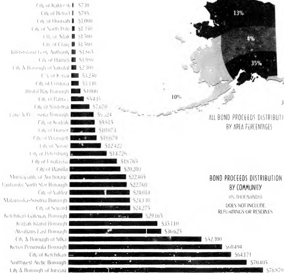
ALL BOND PROCEEDS DISTRIBUTION BY AREA PERCENTAGES

In most instances the Bond Bank is able to relieve municipalities from paying certain costs of issuing bonds, such as official statement printing, trustee and paying agent fees. For this reason, even large communities with a track record of issuing bonds occasionally seek the services provided by the Bond Bank.