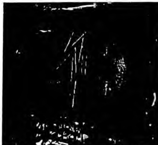
Used hypodermic needles, razor blades and methamphetamine laying within reach of inquisitive children.

At another lab site, a 2-year-old child was discovered during a lab seizure. Her parents both abused and manufactured methamphetamine. She was found with open, seeping sores around her eyes and on her forehead that resembled a severe burn. The condition was diagnosed as repeated, untreated cockroach bites.