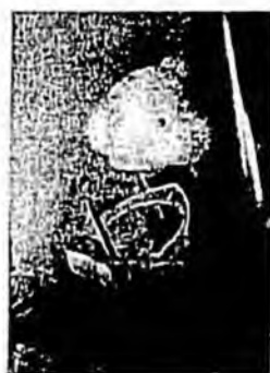
Figure 2: A teddy bear was placed in the methamphetamine lab

We also placed a stuffed bear approximately 12 inches from the cook area. After the cook was completed, the bear was sealed in a plastic bag and returned to the National Jewish laboratory. The pH of the bear was taken by pressing a piece of pH paper on the torso of the bear and then compared to the colorimetric chart. Results indicate that the bear had an extremely acid pH of 1.