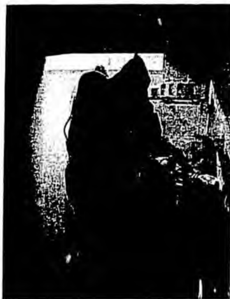
Figure 6: Hydrochloric acid fumes during the salting out phase of the cook

These results indicate that phosphine concentrations can meet or exceed the ACGIH TLV of 0.3 ppm. Hydrochloric acid may also reach or significantly exceed the ACGIH Ceiling TLV of 2.0 ppm during the salting out phase of the cook. Additionally, the maximum concentration of hydrochloric acid can exceed the NIOSH IDLH (Immediately Dangerous to Life and Health) criteria of 50 ppm.