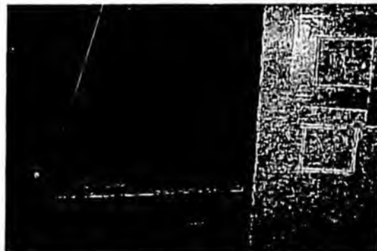
Figure 4: Marked wipe locations taken during controlled cooks.

As this table indicates, methamphetamine was not detected in any of the samples taken prior to conducting any of the cooks. The area was cleaned and sampled before any of the cooks and a 100 cm 2 area marked off for each area. The areas were sampled before the cook and after the cook. Figure 4 shows a typical vertical surface marked for sampling.