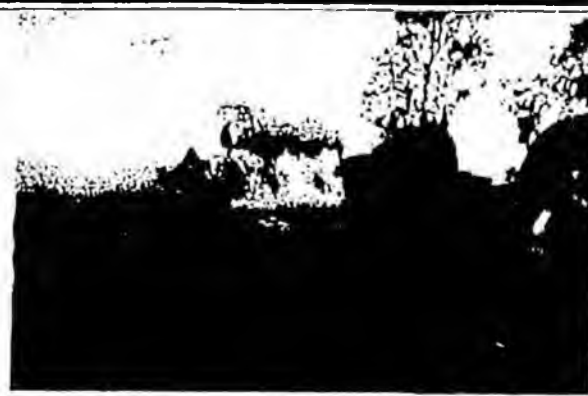
Fire and Explosions

Toxic hazardous waste from meth production is often left in the house or dumped in the backyard where kids play. Every 1 lb of meth made results in 7 lbs of toxic chemical waste. Some of these poisonous chemicals include acids, solvents, drain cleaners, camping fuels and carcinogen items. Meth-abusing parents often use the same household glassware to cook meth and dinner.