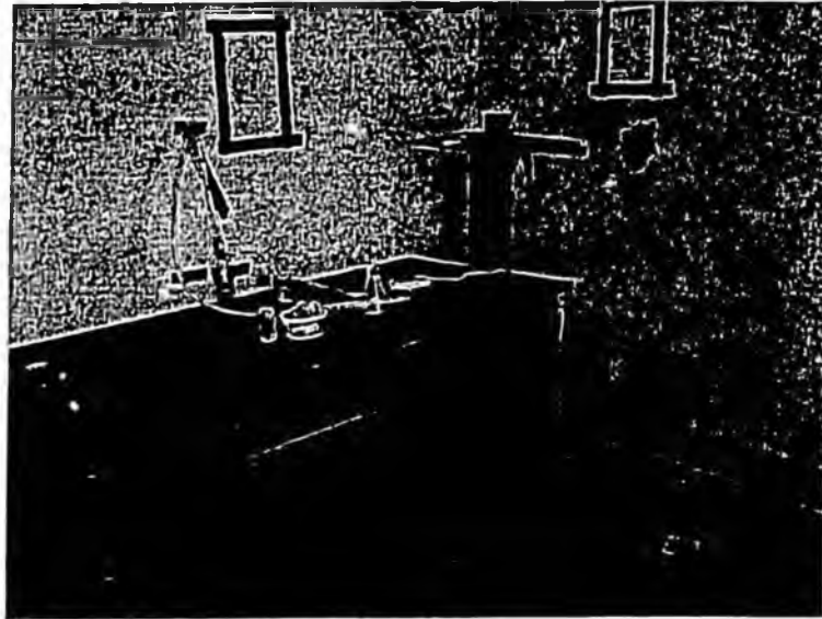
Figure 3: Methamphetamine lab setup in abandoned house.

The building was set up to utilize cooking components that a clandestine cook would be expected to use. The amount of methamphetamine made was, however, less than the amount normally made by cooks, possibly resulting in lower exposure levels. A general cook set-up is shown below: