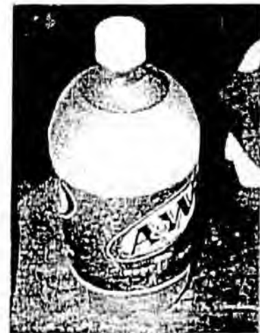
This is an poisoning waiting to happen. Plastic soda bottles are frequently used to store