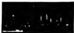
Prisoner of War

Applicants for Prisoner of War plates must provide written verification from the United States Department of Veteran's Affairs that they were POWs. Each applicant may obtain one set of POW plates, free of charge, for display on a non-commercial vehicle.