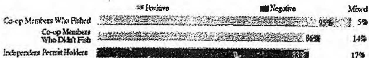
Figure 3. How Do You Feel About The Management Changes in 2002?