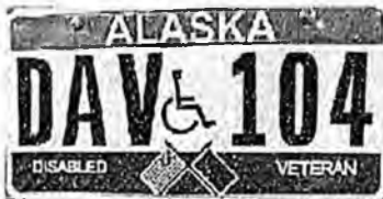
Disabled Vet - Parking Privileges

Disabled Vet plates without parking privileges do not have the wheelchair logo.