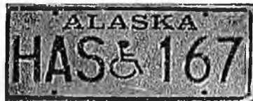
Disabled - Parking Privileges

home driver's manuals license plates parking permits vehicle registration