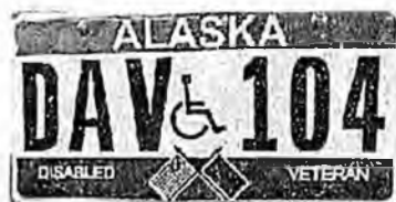
Disabled Vet - Parking Privileges

Disabled Vet plates without parking privileges do not have the wheelchair logo.