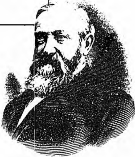
Benjamin Harrison (1833-1901) Twenty-third president of the United States (1889-1893)