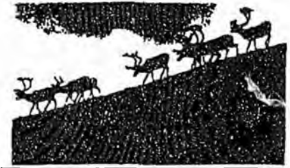
by Wilbur Mills

241 E. Fifth Avenue, Suite 205, Anchorage, Alaska 99501 (907) 276-4048 • FAX (907) 258-6807