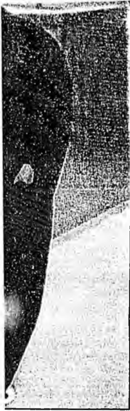
helps kill the craving