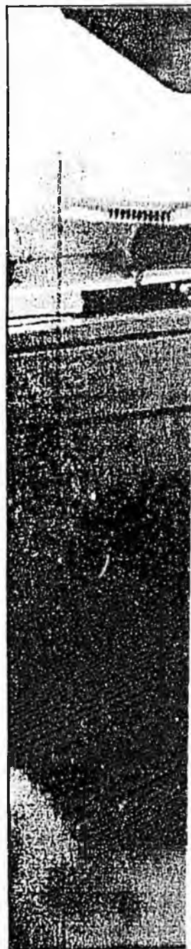
District Judge Peter defendants.

The idea is simple: Identify defendants whose criminal behavior seems to be a result of mental illness. Put them on long-term bail or probation and supervise them closely as they take